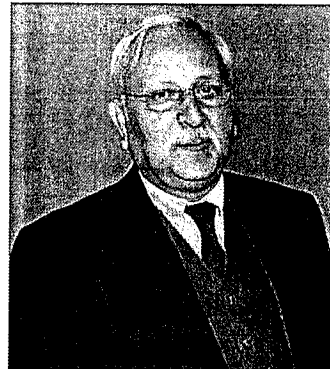
Rajesh Tandon 博士 亞洲研究參與(Participatory Research in Asia) 主席及創辦人之一; 聯合國教科文組織(UNESCO)高等教育之 社區為基礎研究及社會責任主席